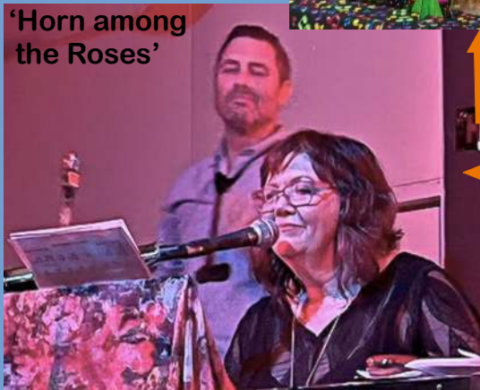
'Horn among the Roses'