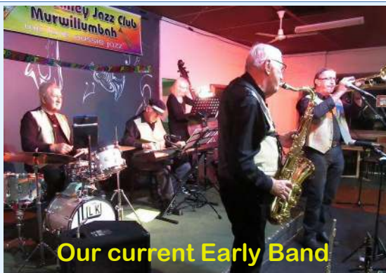
Our current Early Band