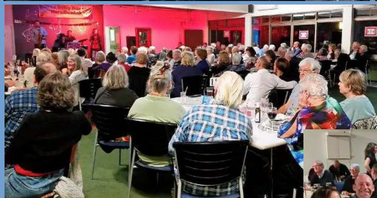
The large and happy audience enjoying 'Horn among the Roses'