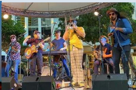
August - Slips & the Flamin' Whippersnappers