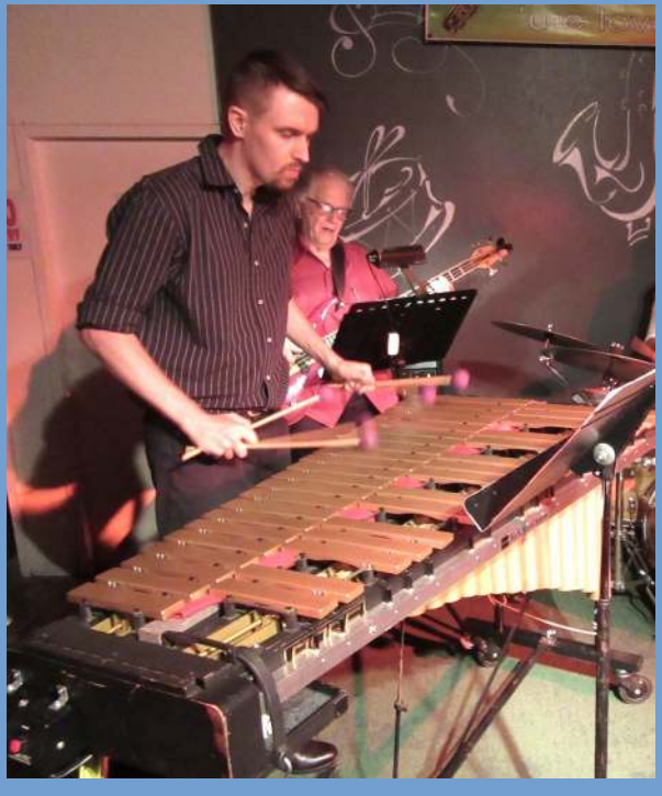
Hammering the metal to make those bars sing.