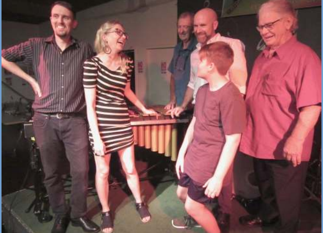
Joking with a young fan.