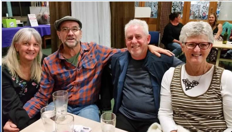
It was a full house for Galapagos Duck