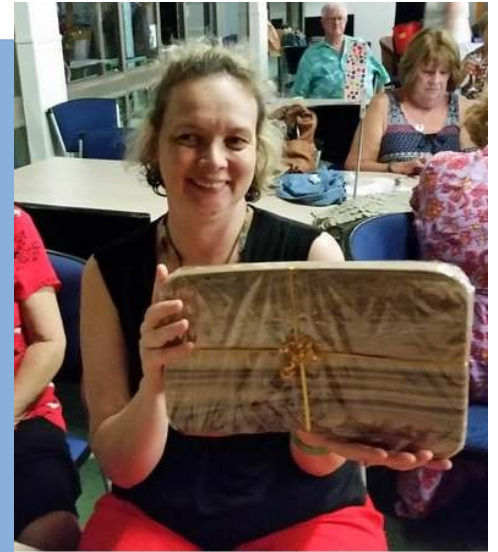
A happy raffle winner