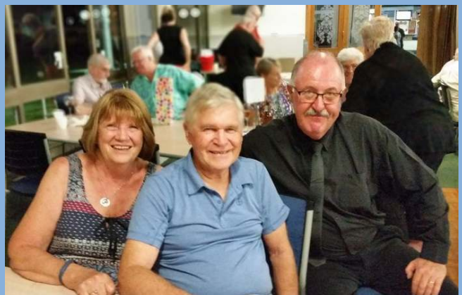
Smiles for the camera