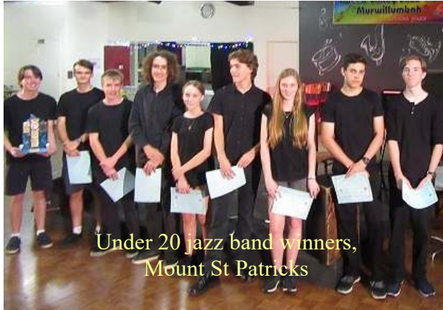
Under 20 jazz band winners, Mount St Patricks