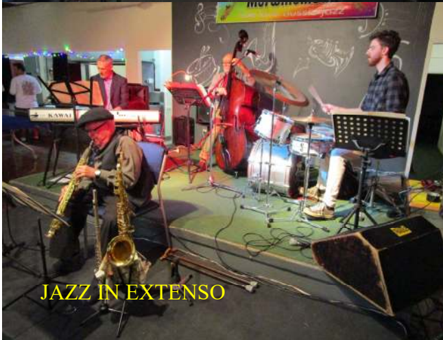
JAZZ IN EXTENSO