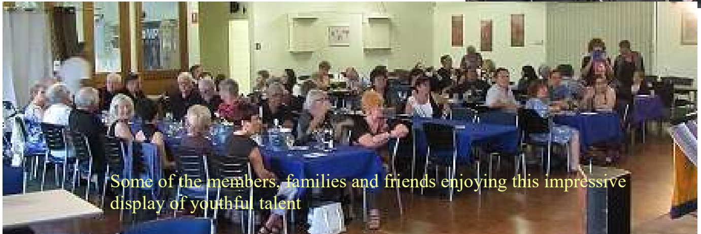
Some of the members, families and friends enjoying this impressive display of youthful talent