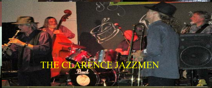
THE CLARENCE JAZZMEN