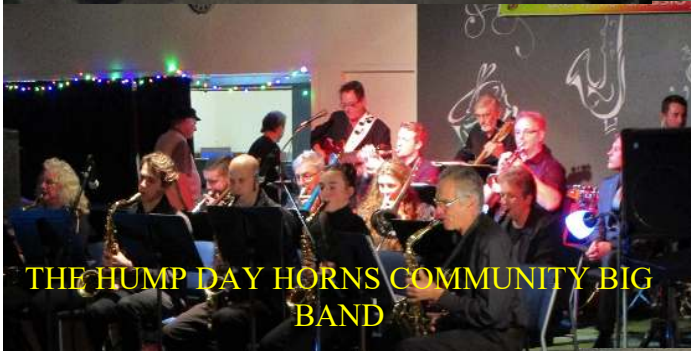
THE HUMP DAY HORNS COMMUNITY BIG BAND