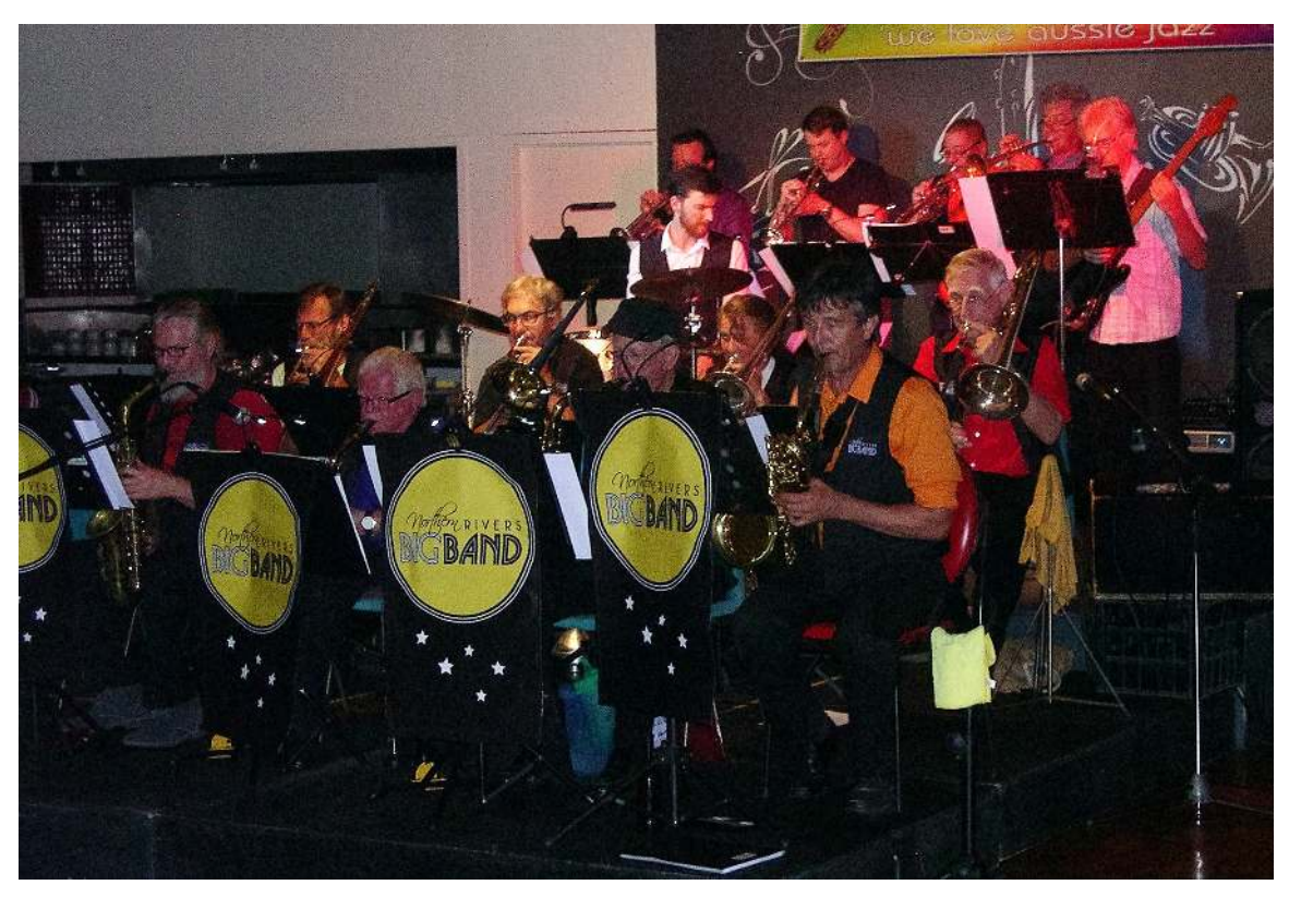
And how grand it was. The wonderful Northern Rivers Big Band