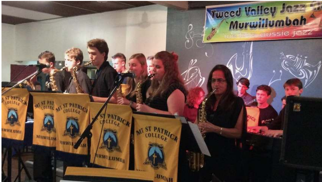
Jazz band 20 years and under Mt St Patrick High

BOOKINGS @ Condong Bowls Ph: (02) 6672 2238 More details @ Website: www.tweedvalleyjazzclub.org