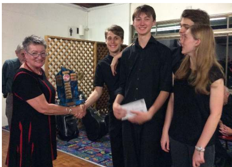
Jazz band 20 years and under Mt St Patrick High