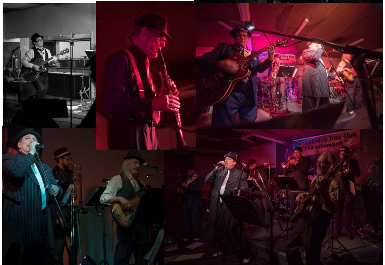
SDS last show at Tweed Valley Jazz brought in a dance crowd.