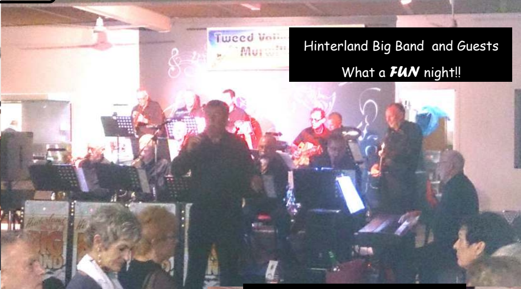
Hinterland Big Band and Guests What a FUN night!!