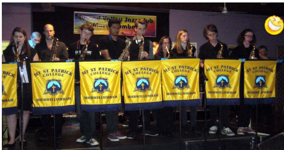
Mt St Patrick College Jazz Band winners of the Performing Arts Festival this year