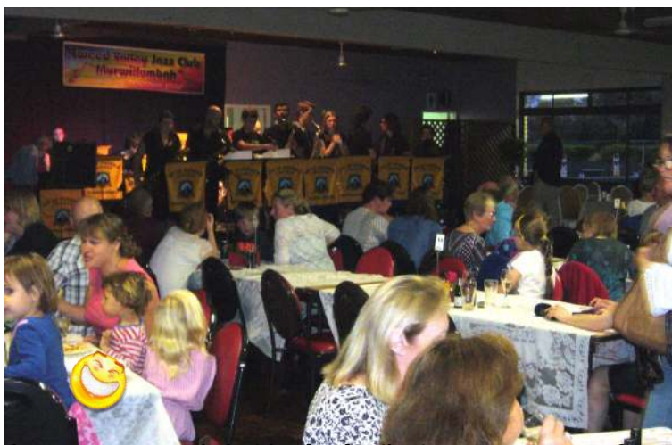
The room was crowded with a fun family air. Can you spot you?