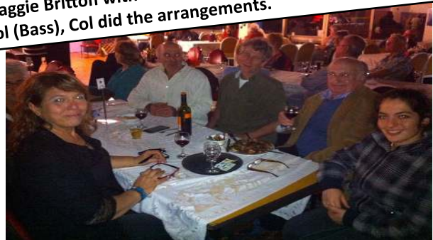
Guests having a wonderful time and 'we'll be back' ☺