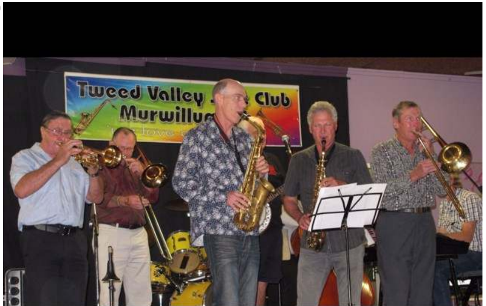
The EARLY BIRDS All Stars. From 6.00 no frills jazz.

The players, yet to be nominated, are always at the top of their game, always play a good hand.