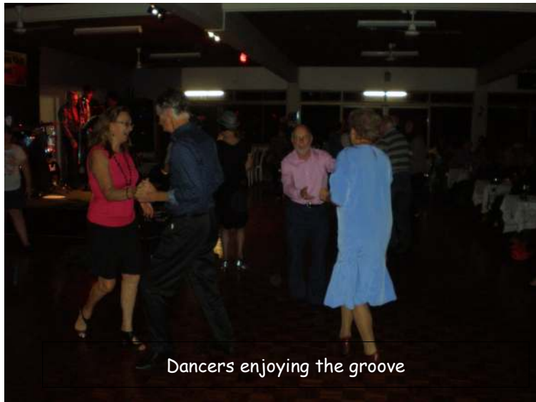
Dancers enjoying the groove