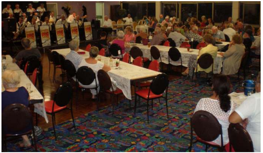
The audience stayed all night and felt they had just come out of the movies with the music the band played!