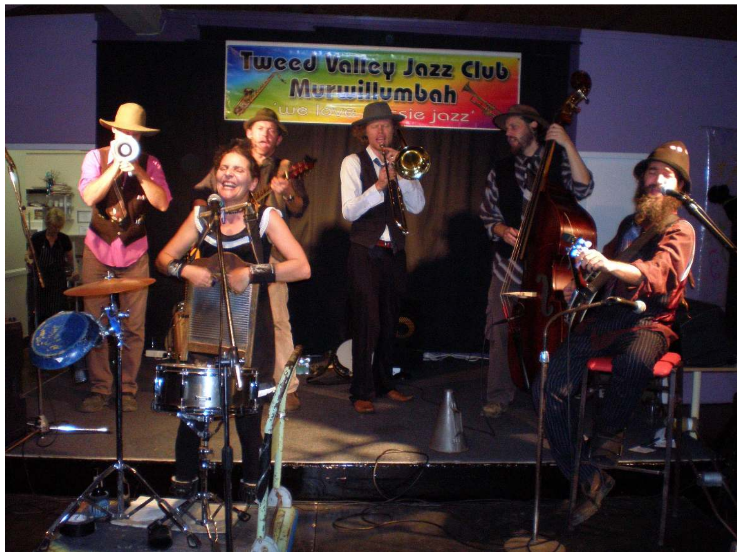
"BLUE SKILLET ROVERS JUG BAND"