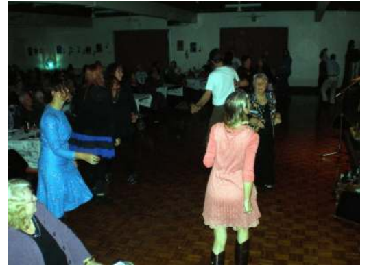
"THE EARLY BIRDS" above, DANCERS far right