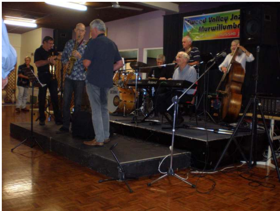
"THE EARLY BIRDS"