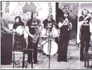
Rank 'N' Banned at the Australian Jazz Convention, Hobart 1977