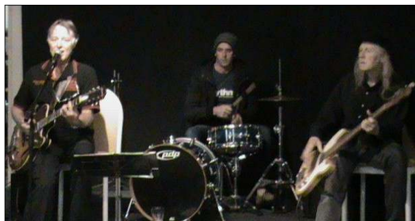
The Blind Willie Wagtail