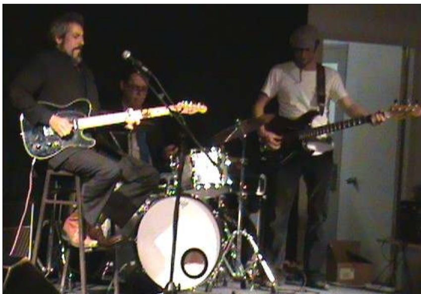
The Mojo Webb Band