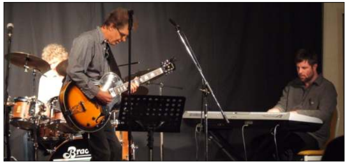
The Clem Four