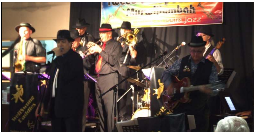
The WellSwung Daddies